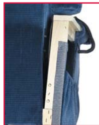
501 M shown