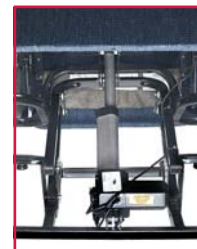
501 M shown