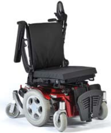
Flip-up armrests and foot rests for easy accessibility