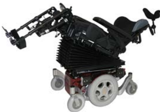
Lift-off backrest for easy transportation and storage