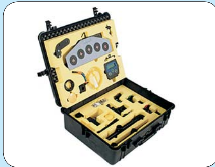
Speciality Controls to meet the full range of paediatric requirements.