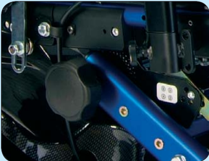
Hand controls to adjust seat and back angle.