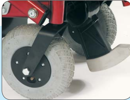
Kerb Climber (option) and 9 inch castors (standard).