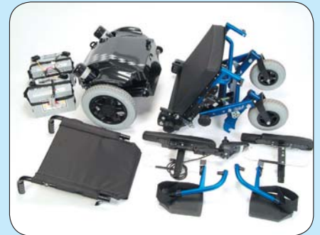
De-docks and disassembles without tools for easy transport.