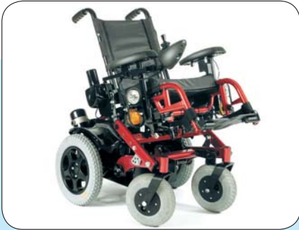
Seat height and centre of gravity adjustment (one tool).