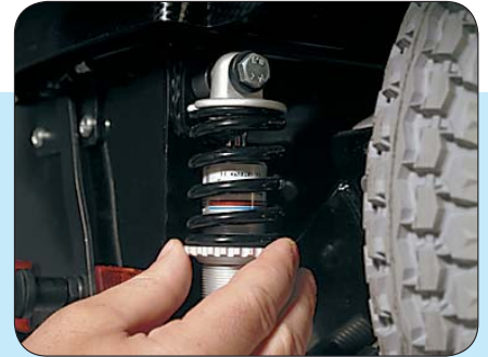
Adjustable suspension for improved comfort and ride.