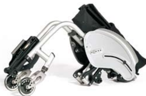
Small folding (Fixed front)