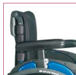
Wide range of side guards and armrest options