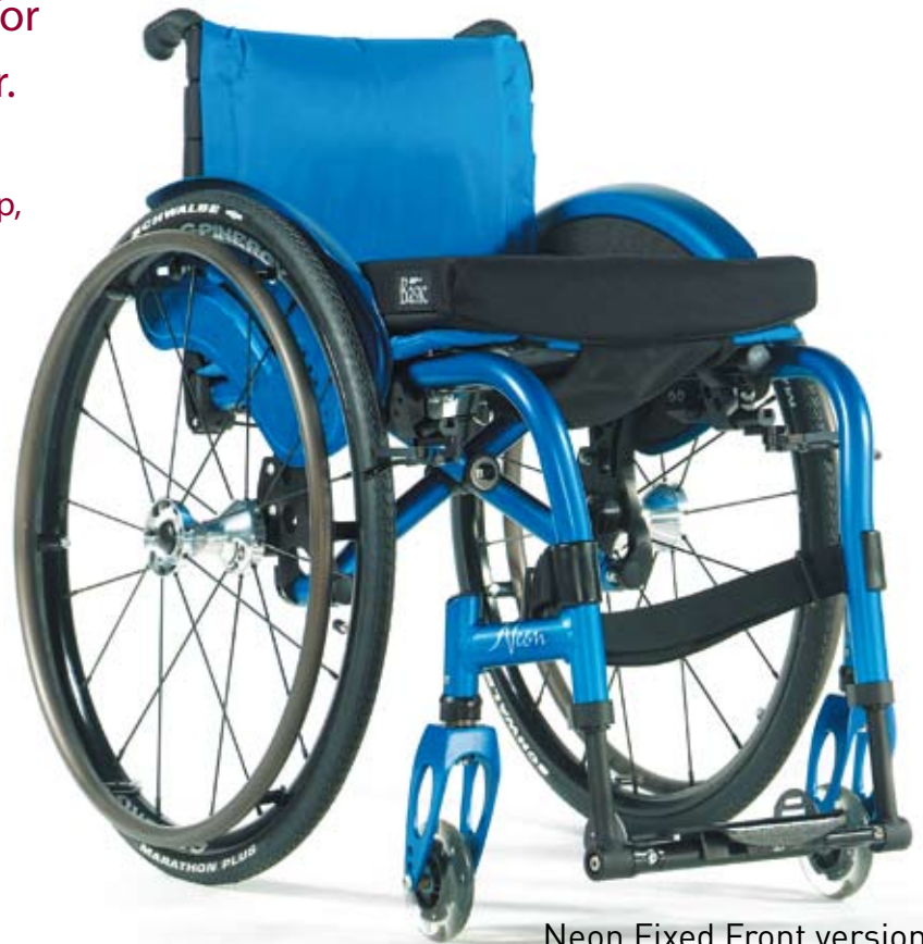
Neon Fixed Front version

Lightweight frame weighs just 7.1 kilos with intuitive folding cross brace with retaining strap, removable legrests and fold down backrest.