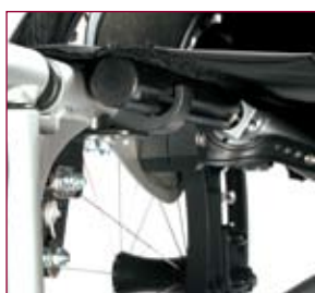
Internal cross-brace ensures optimum rigidity and drive performance