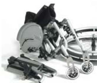
Fast folding frame and back with quick release legrest ensures convenient transportation