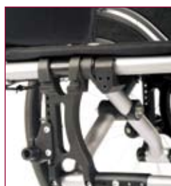
Simple seat height adjustment with preset factory "centre of gravity" settings