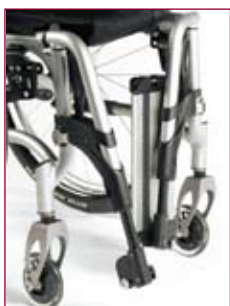
Neon Swing-away: with swing-in and swing-out function