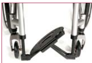
Auto-folding footboard (option)