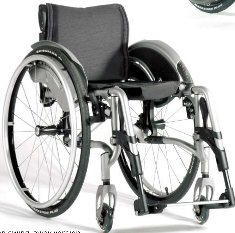
Neon swing-away version