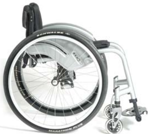
Modern open frame design (Fixed front)

3.7 million colour combinations including 6 upholstery colours and 27 brilliant and matt paint finishes for your frame, hubs, forks, wheels, handrims and footplates.