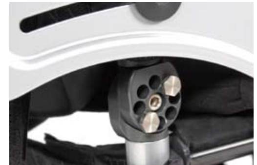
Backrest angle adjustment (optional) Lightweight and simple to adjust. Provides 18° angle adjustment, from -9° to +9° in 3° increments