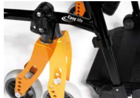
Simple and quick to adjust fork angle With increased angle range to ensure optimal driving performance