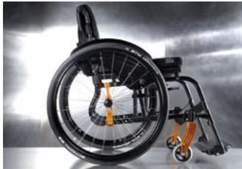
Fixed front version

When you lead an active life, you need a chair that you can rely on. Quickie Life combines a quality, lightweight build with a stylish design. Perfect for those who don't want to compromise.