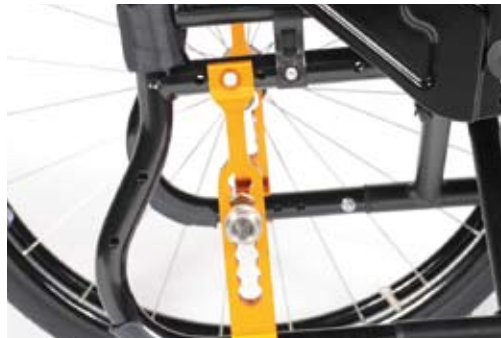
Seat height adjustable in 7 positions With a camber from 0°-4°. Axle plate available in 3 anodized colours (orange, black and silver)