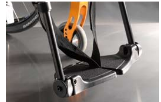
Divided composite footrest With angle adjustment