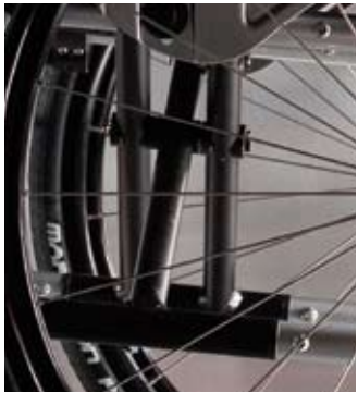
3 arm cross brace system Provides strength with reduced weight and clean look