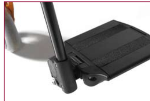
Divided aluminium footrest Angle and depth adjustable

Offered in 3 frame lengths, with standard or active hangers both in 70° and 80°