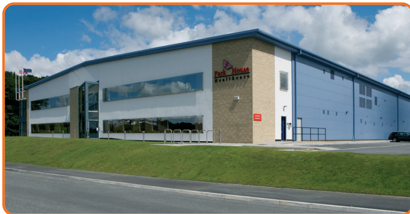
New Corporate Headquarters opened in October 2006