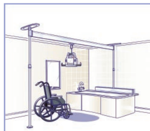
The 2 post Easytrack with bath bracket