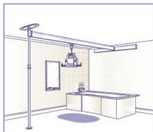
The 2 post Easytrack with wall bracket