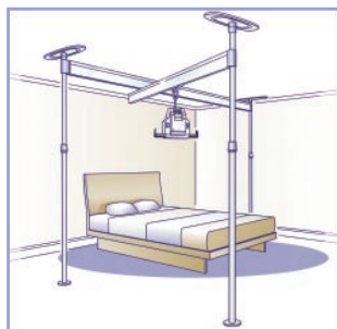
The 3 post Easytrack

The 3 post Easytrack is suited for transfer over a bed or bath and down a room. This system negates the need for a traditional curved track: