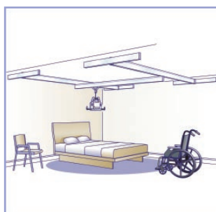
An x-y system without posts and with 4 wall brackets.