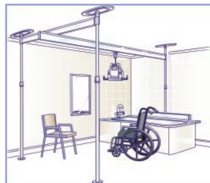
The 3 post Easytrack with bath bracket