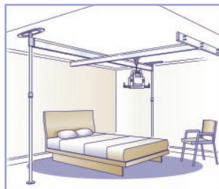
The 3 post Easytrack with wall bracket