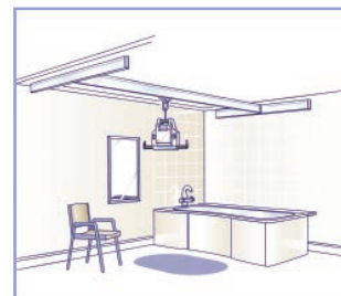
The 2 post Easytrack without posts