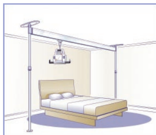
The 2 post Easytrack

The standard 2 post Easytrack is suited for transfer over a bed or bath in a peninsular setting: