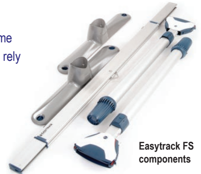
Easytrack FS components