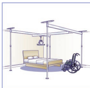
The 4 post Easytrack operates like a traditional x-y system covering all 4 corners of a room. The 4 post is not telescopic